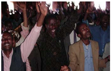
Spiritual Refreshment for Ethiopian Pastors

T solated from the outside world for centuries... Ethiopia is ripe for spiritual harvest. Most pastors had no bibles and even fewer had any training. In the past two years we have provided bibles to hundreds of pastors and we teach and train the pastors to reach their county.