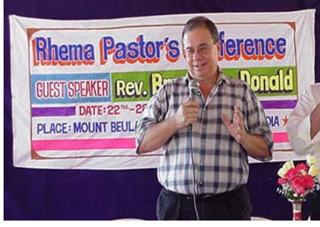
Andhra Pradesh. India Pastor's Conference

FRICA: The church in Latvia has recently expanded to include new churches in previously unreached areas. We lived in the former Soviet Union for ten years prior to relocating to Africa. Through the years of pastoral training and church planting, the foundations for continuing growth were established. We will be in Russia and Latvia for a substantial amount of time later this year as we minister to the pastors and leaders of the established and developing churches.