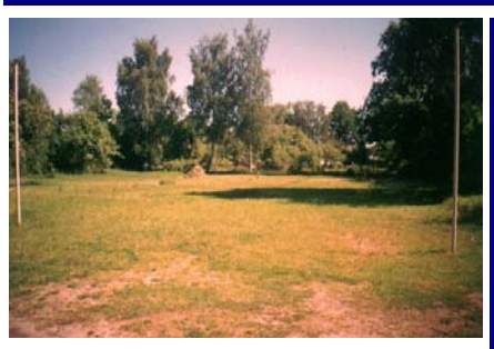
Location for the church building

T he Greenhouse Church: A greenhouse was situated on the property we purchased, and having been denied permission to meet in any public facility or to construct a building, the greenhouse became the home to the Jurmala church. Throughout the harsh Latvian winters, with temperatures often reaching -20^{\circ} F, the Christians have remained faithful in attendance and their commitment. Although the plastic greenhouse is extremely modest, the Spirit of the Lord is present and the services are powerful.