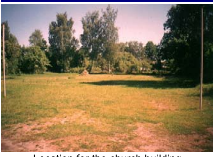
Location for the church building

The Greenhouse Church: A greenhouse was situated on the property we purchased, and having been denied permission to meet in any public facility or to construct a building, the greenhouse became home to the Jurmala church. Throughout the harsh Latvian winters, with temperatures often reaching -20° F, the Christians have remained faithful in attendance and their commitment. Although the plastic greenhouse is extremely modest, the Spirit of the Lord is present and the services are powerful.