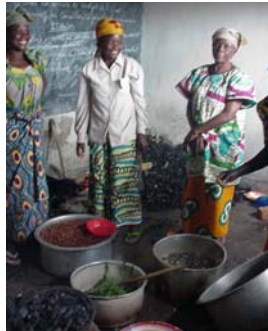
Torn By Money is scarce in this devastated land. Pastors and women come to conferences the both spiritually and physically hungry. Each day food was provided for the delegates.