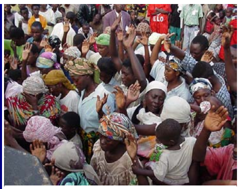
Multitudes receive salvation every day

Grenades & Bombs are part of daily life in Burundi. From our hotel room we could hear the explosion of bombs fill the silence of the night. One night during the conference, the rebel army raided our Bible school building as the pastors slept. Every day, government soldiers searched people for guns and grenades as they came to the crusade services. The realities of life in war torn Africa did not deter people from coming to the first open air crusade in almost a decade in the township of Kamenge. A gospel explosion began to replace the explosion of bombs as people rushed to receive the eternal life that only Jesus promises.