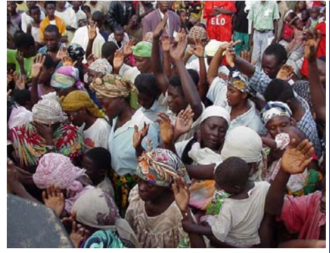
Multitudes receive salvation every day

Guns, Grenades & Bombs are part of daily life in Burundi. From our hotel room we could hear the explosion of bombs fill the silence of the night. One night during the conference, the rebel army raided our Bible school building as the pastors slept. Every day, government soldiers searched people for guns and grenades as they came to the crusade services. The realities of life in war torn Africa did not deter people from coming to the first open air crusade in almost a decade in the township of Kamenge. A gospel explosion began to replace the explosion of bombs as people rushed to receive the eternal life that only Jesus promises.