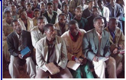
Almost eight hundred eager pastors and evangelists are taught at conference

A lmost eight hundred pastors and evangelists crowded into a dusty church building constructed of bamboo: None of these men have had the privilege of attending seminar or receiving any formal training. Traveling great distances, the men arrived tired, but excited and ready to receive and be taught. One of our purposes in holding crusades in conjunction with pastor's conferences is to demonstrate effective ministry to the leaders. Practical teaching includes organization, preaching and retention of new converts from the crusade.