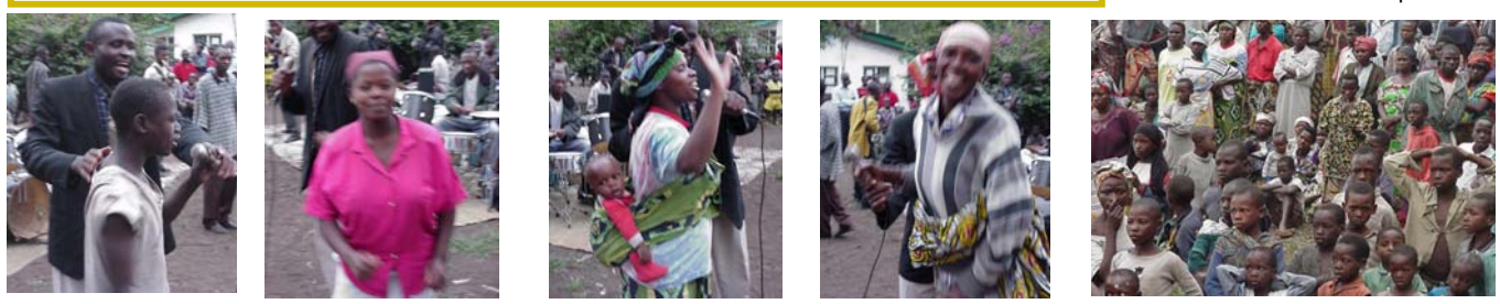
(L-R) Blind Man Sees, Paralyzed Arm Healed, Dumb Woman Speaks, Deaf Woman Hears, Salvations in Congo

"Our desire is to preach the gospel in the regions beyond" 2 Corinthians 10:16