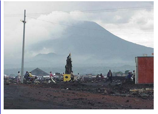
Goma, DR Congo Crusade

Volcano Comes To Life: Seven volcanoes surround Goma, DR Congo. During a crusade we held one of the volcanoes came to life and eventually erupted. The destruction in the city is difficult to describe. The volcano is again active with smoke, steam and fire being emitted. In times of difficulty, people turn to God as the only hope. Over the past three years, thousands of people have been saved in Goma through our crusades. Many of those saved are now in heaven as a result of their response to the gospel message. In 2003 we held another crusade in which the backdrop was the photo at right.