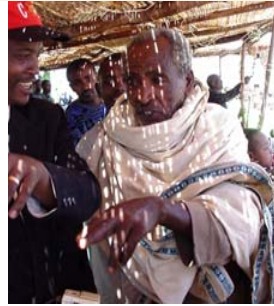
Blind Man Healed