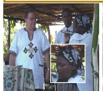
Deaf Woman Healed

Salvation To The Ends Of The Earth: Acts 13:47-49 In the midst of heat, dust and eight to ten hour services, the excitement of large crowds soon passes. Nights that are too short, food that leaves much to be desired and the weariness of an incredible ministry schedule are our companions. It is here that we experience the reality of God's call on our lives and His desire that none should perish. Many years ago while traveling in Mongolia, the words of the circuit riders was carved into my heart "It is worth it all to see the salvation of souls". In the deep parts of Africa, in areas where few (if any) go; where life spans are short; where false religions (and worse) are more common than Christianity; and where they will never hear unless the gospel is brought to them, people are being saved!