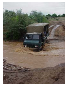
Travel in Sudan