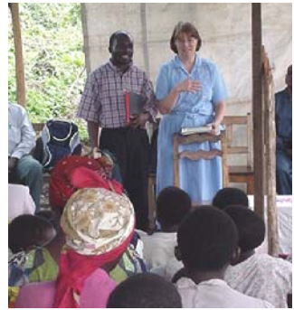
Women's Seminar in DR Congo