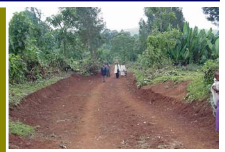
Church Members Dug A Road Through Rugged Terrain.

Road Is Constructed By Hand: The location of the crusade was so remote that it was inaccessible by vehicle. In their desire to have us come, the local church built a road by hand. For several days approximately 120 men and women constructed a road through the rugged terrain on what was previously nothing more than a foot path. The sight was indescribable as we entered into the crusade grounds. Waiting for us were thousands of people who began to shout with joy as our vehicle approached.