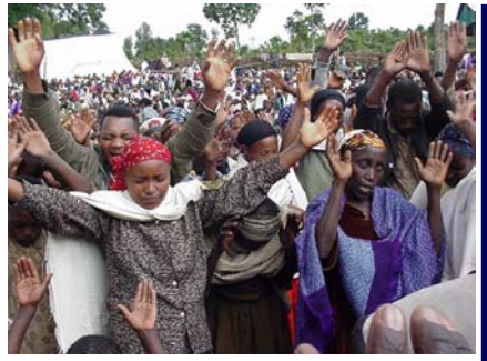
Salvation in Yirgacheffe

Yirgacheffe: Deep in the coffee growing region of Ethiopia, we held a pastor's conference and "Big Meeting." After winding up a mountain the vehicle veered off the road onto what seemed to be nothing more than a foot path. We were wondering where we were going and if there could possibly be any people at such an odd location. To our surprise a road suddenly appeared. An even greater surprise was waiting for us about two kilometers later as a large field filled with people suddenly emerged.