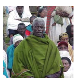
Salvation For Everyone