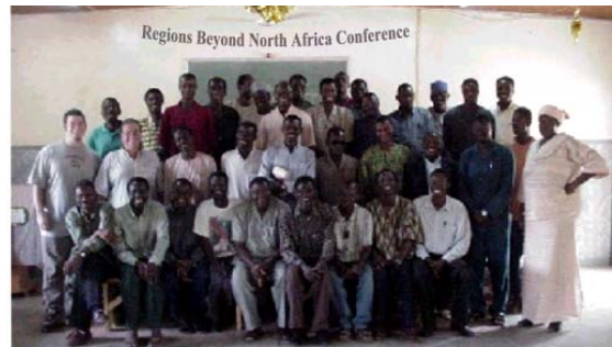
Interdenominational Pastor's Conference

North Africa Pastor's Conference: We held our second national pastor's conference in the Islamic country of Niger. Nearly every pastor in the country participated. Pastors came from every denomination including Baptist, Pentecostal and SIM. The common thread was a desire to be taught the Word of God and to see Niger saved. In the midst of extreme temperatures, we taught from 8:00AM until 5:30 PM followed by a night crusade.