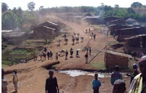
Real journey begins at town of Choreso Mazoria

R iding a mule to the crusade was perhaps the most unusual means of transportation I have taken: This trip was the most difficult physical trip I have had in years. After a long journey over rough roads, we arrived in the town of Choreso Mazoria, pictured at left. The town was hot and extremely dusty. The crusade site was at the top of a nearby mountain. I would have never thought I would be so thankful to ride a mule. I was reminded of the words the circuit riders: “It is worth it all for the salvation of souls”.