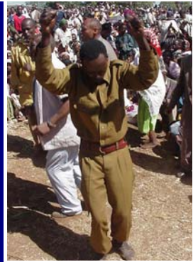
Soldier Experiences the power of God in crusade

D ifficult to reach...Physical challenges...Spiritual battles: These are often the best places to hold crusades as remote places in Africa often have large and unreached populations. While the challenge is great, many of the people will hear the gospel for the first time. Because such places contain inherent hardships and lack of medical care, life spans are short with an average life expectancy of 38. Without the gospel being taken to them, they may enter eternity without the knowledge of Jesus, and because of tribal discrimination and hatred, it is often someone from another land who can most effectively bring the gospel to these people. Remote areas of Africa are often deeply embodied in tribal religions and witchcraft. The power of God breaks the bondage of demonic power.