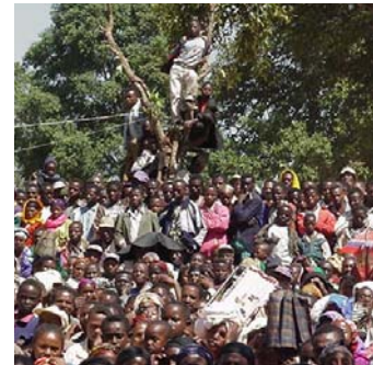
Crusade Crowd In The Trees