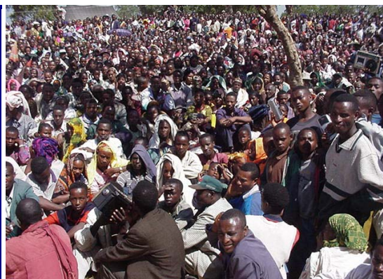
Portion of the crowd encircling the speaker's platform

C horeso Mazoria is located on top of a mountain and in a very remote area of Ethiopia: Even though there were no facilities of any kind, over 20,000 people attended the four day crusade. Resembling an old fashioned camp meeting, people stayed the entire time. After the first night it looked like a city had been erected with grass huts, kitchens and places to take the demon possessed. We were not able to get a reasonable estimate of the number of people saved, because the crowds were so large and pressed in to the platform where I was ministering. However, the pastors reported that there were well over 1,000 salvations.