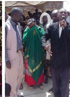
Lame Woman Walks