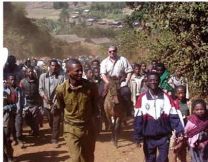
Journey by mule continues up the mountain