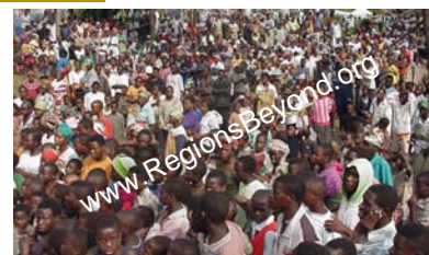
Crowd To Right Of Platform

"Our desire is to preach the gospel in the regions beyond" 2 Corinthians 10:16