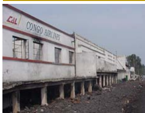
Volcanic Destruction in Goma