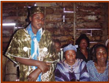
"We Lost Our Husbands In The War"

Y ears of genocide, killing two million people, and the devastation of the volcanic eruption have left Eastern DR Congo in physical and spiritual turmoil. Affirmed by the incredible events of this past trip, the greatest spiritual hunger we have ever experienced is arising from the devastation. Occasionally in our ministry we have the awesome sense of being in the right place at the right time otherwise known as the perfect will of God. Seldom have we expressed personal feelings in our newsletters as we have often struggled with the emotions of the destruction we have encountered and keeping the proper perspective on our ministry calling and the purpose of God for our lives. These are real issues as most of our ministry are in areas of great physical and spiritual difficulty. I was astonished when entering Goma and the refugee camp. In Goma I was stunned by the destruction, in the camp it was by the hunger for God. The only way I can adequately describe my feelings is through what I told the Lord that day, "This is what I was created for."