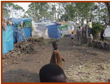
Life in Refugee Camp