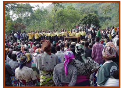
Choir from Goma in Refugee Camp

THE REGIONS BEYOND. . . More Information on Central Africa . . . Please refer to the following newsletters: Land of Volcanoes & Pygmies May 2001 ; Goma Crusade Summer 2001 . Copies have been uploaded to our web site at: http://www.regionsbeyond.org . Jurmala, Latvia "Greenhouse" Church . . . The foundation is complete and we are waiting for approval from the building inspectors to begin the next phase of construction. $29,520 of the estimated $33,000 needed for the church building has already been received. Please pray for approval by the inspectors and for the additional money needed for the building. After eight years of meeting in a rented room followed by two years of meeting in the plastic greenhouse, the church will have a permanent sanctuary.