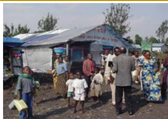
Church Started Through Crusade