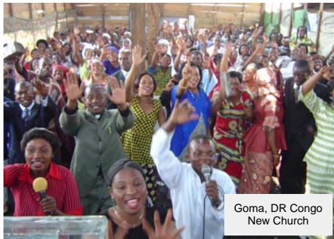
Goma, DR Congo New Church