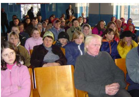
New Church Established in Ukraine