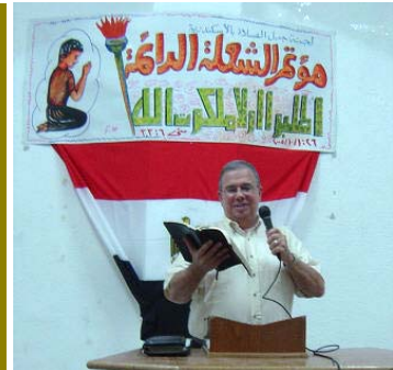
Training Leaders in Egypt

Desert in Egypt: It has been reported that two-thirds of all evangelical churches in Egypt do not have a pastor. Although Egypt can be considered a spiritual desert, it is not a wasteland and there is opportunity to bring refreshment to Christians who desperately desire help. In a conference designed to begin training new leaders for the church, people from many denominational backgrounds attended, including Baptist, Church of Christ, Pentecostal and Presbyterian. The common desire was to know more of Jesus and learn how to minister to the church. Please pray for open doors to continue training new leaders in Egypt.