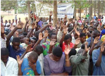
People Respond To The Invitation

Salvation At Place of Genocide: During the genocide, millions of people fled into Congo where refugee camps were established. During this time and the years since, we have ministered extensively in the refugee camps and in Rwanda. It is impossible to estimate how many people have made confessions of salvation in our crusades in these areas, but it would certainly be in the hundreds of thousands. The genocide ignited a revival that continues as people realize eternity is a reality.