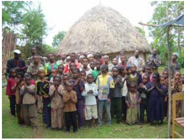
Ten New Churches Were Started in the Omo Valley in 2006.

Wild & Inaccessible: These words are often used to describe the Omo Valley region of Ethiopia. Without doubt this is one of the most primitive regions of Africa and is home to some of the last remaining indigenous tribes. With a virtual lack of communication, few passable roads, frequent flooding, and a hostile topography, it is difficult to reach the area and people. Adherence to the old ways and customs, tribal religions and resistance to change have resulted in few Christians and even fewer churches in the Omo Valley.