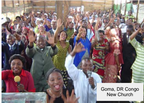
Goma, DR Congo New Church