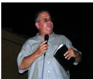
Crusade in Islamic Country